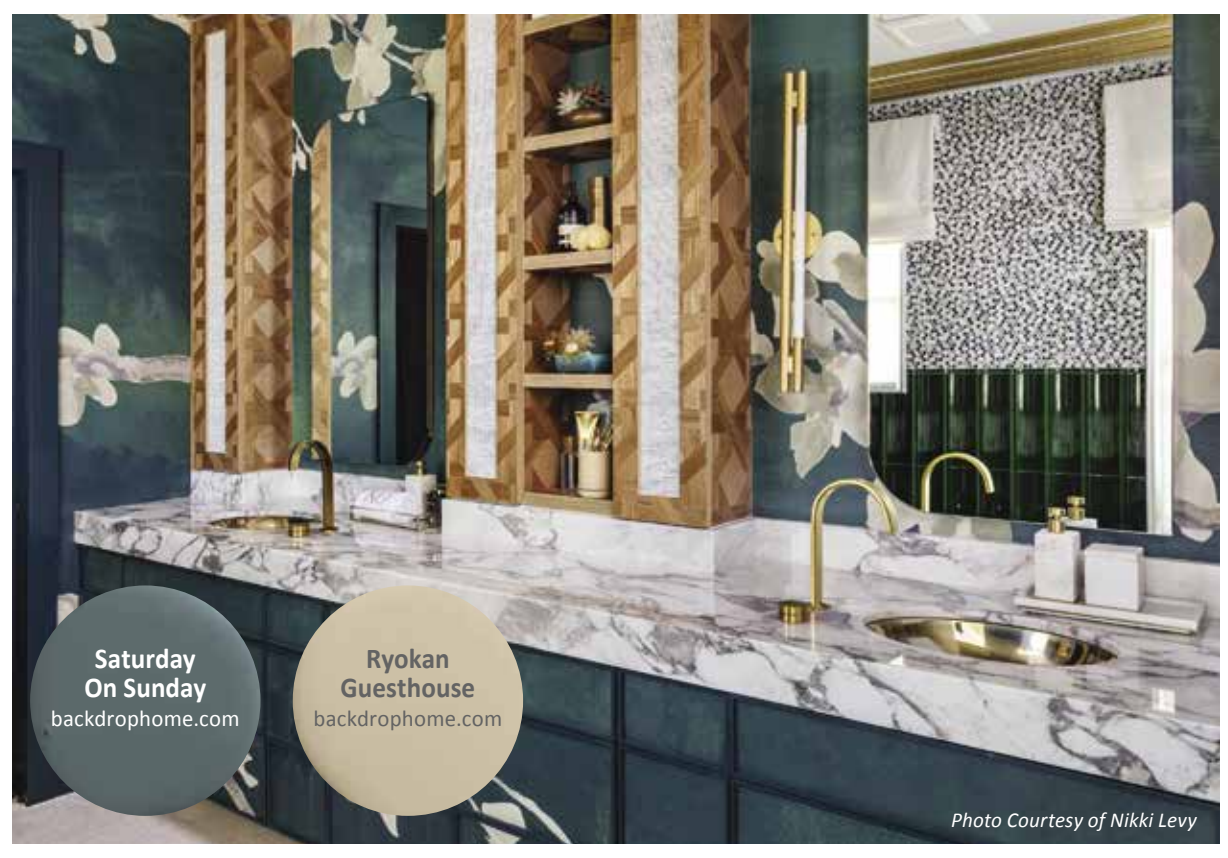
Modern and sleek fixtures blend with intricate woodworking and bold design to create a seamlessly chic space. Teal, emerald green, white, and gold connect to create a monochromatic scheme that feels light and effortless in this stunning bathroom.

Patterned wallpaper with bold design and soft pastels make this space stand out. Designer Amanda Reynal uses texture and color to construct a calming, yet uniquely bold room perfect for South Florida.